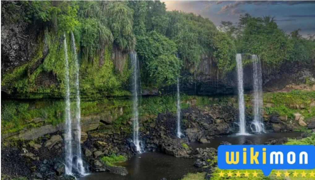
Bayankhongor province youth federation ezemshigchiinkh