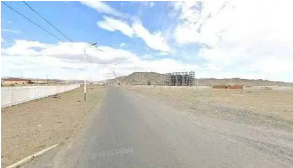
Bayankhongor province youth federation bugd