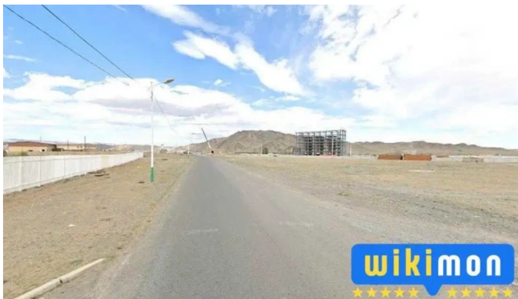
Bayankhongor province youth federation ????????????